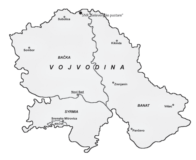
Map 1. Geographic position of SNR "Selevenjske pustare" in Vojvodina