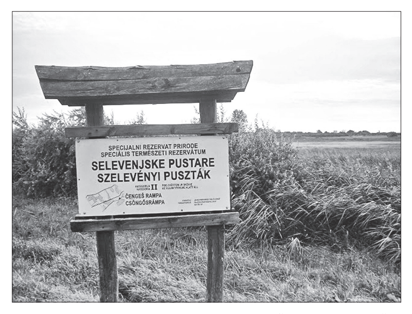
Picture 1. Info panel in the Special Nature Reserve "Selevenjske pustare"

Selevenjske pustare is mostly covered by steppe vegatation, and the habitats are open, warm and dry as a reflection of ecological occasions on the contact of loess and sand. Unstable sandstone vegetation gradually became the steppe vegetation with specific fea-