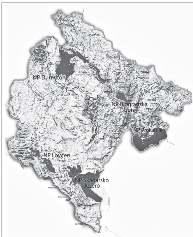
Map1. Geographic position of NP Durmitor within the territory of Montenegro (1:950,000)