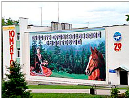
Image 5. The Yumatova Sanatorium in Bashkortostan