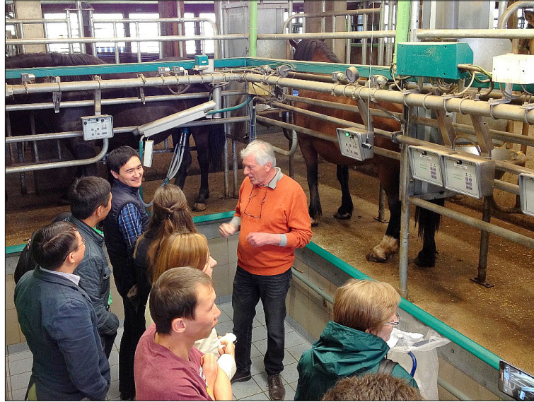
Figure 2. Kumiss Production Facilities in Germany