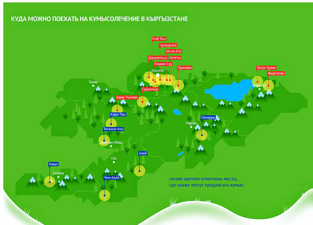
Figure 4. Distribution of Kumiss Treatment Facilities by Region

As seen also in Image 4, kumiss treatment is used almost in every region of Kyrgyzstan. The region where the facilities providing kumiss treatment are located most is the Chuy region which also includes the capital Bishkek. Prices in these facilities are determined according to service given. Nevertheless, it is stated that the daily average prices are between 1200 som (approximately 18 dollars) and 19000 som (approximately 280 dollars). Patients staying in those