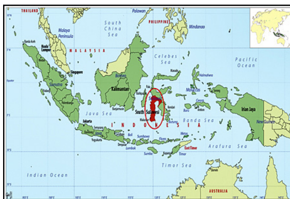
Figure 1. Map of Jeneponto regency of South Sulawesi province of Indonesia

Jeneponto regency is well recognised with its “horse” ( kuda in Bahasa Indonesia and Jarang in the local language), a brand that brings Jeneponto as the center of horses (Wangsyah, 2016). Horse meat is mostly consumed by Jeneponto people. Thus, it is not surprising that coto kuda