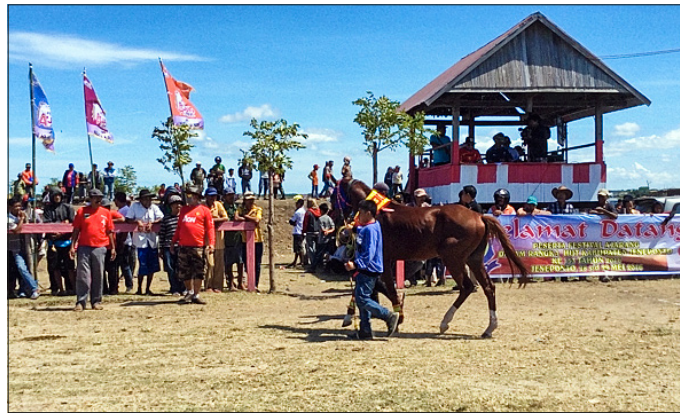
Figure 2. The A'jarang festival in Jeneponto regency