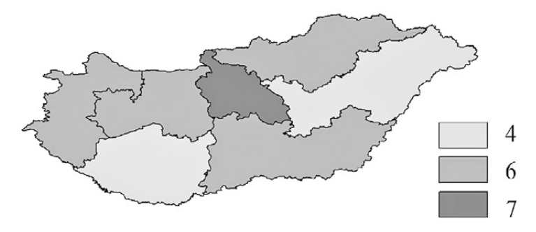
Figure 2. Shift-share analysis results (based on the classification categories in Table 1) 4: greater change than average, positive regional factor, negative structural factor 6: smaller change than average, positive regional factor, negative structural factor 7: smaller change than average, negative regional factor, negative structural factor

In Hungary, the importance of the tourism sector has been strengthened since the economic crisis, but the development of tourism and the number of people working in tourism still need to be increased. Nowadays, the consumer behaviour "takes the life easy" as increas-