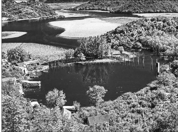
Figure 2. Karuč Village, National Park Skadar Lake