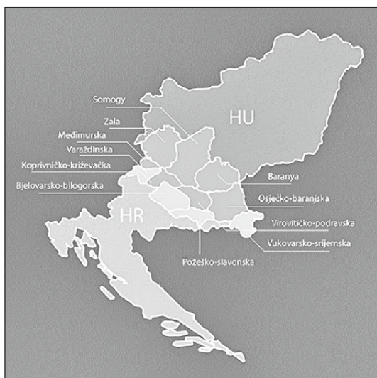
Figure 1. The Programme Area of the HU-HR (IPA) CBC Programme 2007-2013

The Programme area including Hungarian and Croatian counties in the 2007-2013 programming period comprised a total of 31,028 km 2 . On the Croatian side, in addition to border counties – Međimurska, Koprivničko-križevačka, Virovitičko-podravska and Osječko-baranjska – four other counties (Varaždinska, Bjelovarsko-bilogorska, Požeško-slavonska and Vukovarsko-srijemska županija) could participate as so-called 'adjacent regions' and could utilise the maximum of 20% of the amount of EU contribution available in the Programme. The eligible area on the Hungarian side involved the NUTS III border counties of Zala, Somogy and Baranya (Figure 1).