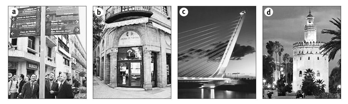
Figure 1 Adequacy of the tourist product a) Tourist urban Signpostingg; b) Renovation Office of Attention to the Tourist; c) Vanguardist architecture Renowned architects; d) Lighting enclave and monumental sets

New cultural heritage on a symbolic and emblematic scale. In order to accentuate the uniqueness and identity of the city in the Spanish and European tourist context, the construction of one-of-a-kind buildings that identify the city had been commissioned to renowned architects, among them: Calatrava's ultramodern bridge or Rafael Moneo's new international airport. Likewise, in the year 2008, the works of a residential neighborhood were started thanks to the "galactic ones" of the current architecture, among them, the Frenchman Jean Nouvel, the British Norman Foster and the Japanese Arata Isozak.