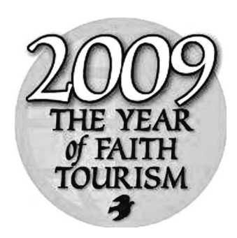
Figure 8. The symbol of promoting the year of faith tourism in the world

Here also we need to emphasize the importance of these group of factors for one pilgrimage destiantion: socio-economic and psychological characteristics, level of usage, length of stay and tourist traffic by season, type of tourist activities and level of tourist satiosfaction (Jovičić, Dragin, 2008).