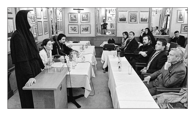
Figure 7. The first conference on faith tourism in the Balkan Hotel in Belgrade, 2006

development should be assigned to Serbian Orthodox Church and municipality tourist organisations (Photo 6). It was also pointed out that faith tourism should create the opportunity for the local population to actively participate in its organisation and that it would become a driving force of economic development in the settlements surrounding the sacred places and monasteries (Scientific meeting documents, 2006 and 2009).