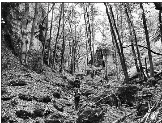
Figure 5. The fossil canyon of Demižlok

Lazar's Cave is located downstream, at the end of Lazar's Canyon, 6.70 meters above the Lazar River bed. The total length of the explored part of the cave is 1592 meters of which 1225 meters belongs to the dry channels (Vasiljević, et al., 1998).