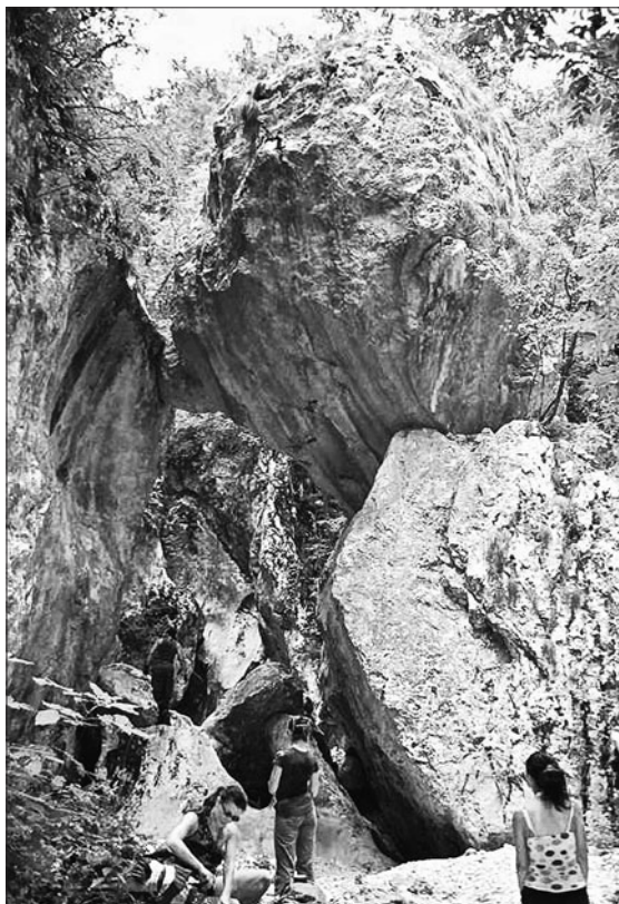
Figure 3. Rocks and boulders at the canyon entrance

Malinik Mountain is located on the right side of Lazar's Canyon in the shape of a prominent ridge expanding from northeast to southwest, reaching maximum height at its isolated conical hill called Veliki Malinik, 1158 meters above sea level. Its northern steep side and its highest peak are built mainly from Paleozoic shales, while