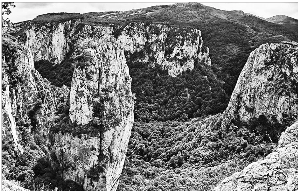
Figure 4. The rock tower located at the junction of Mikulj River Canyon and Lazar's Canyon

the northeastern side is made out of limestone. The southeastern slopes of Mali Malinik are covered with foliated metamorphic rocks (Figure 6) (Vasiljević, et al., 1998).