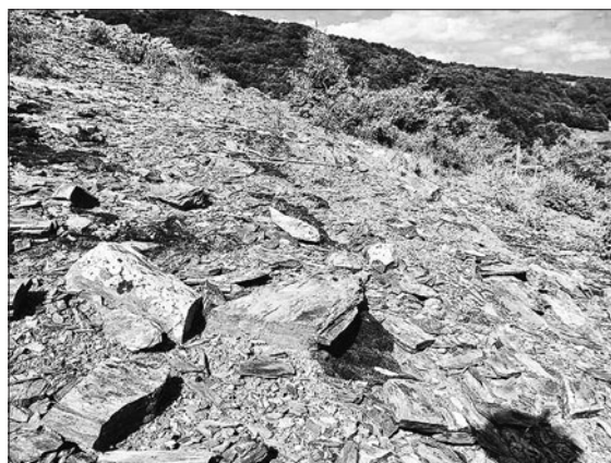
Figure 6. Foliated metamorphic rocks of Mali Malinik

This cave is also characterised by vast amounts of calcite and crystal accumulation, which form extremely diverse and imposing figures like the stalagmite Colossus, which is the symbol and logo of Vernjickica with a height of 11.5 meters.