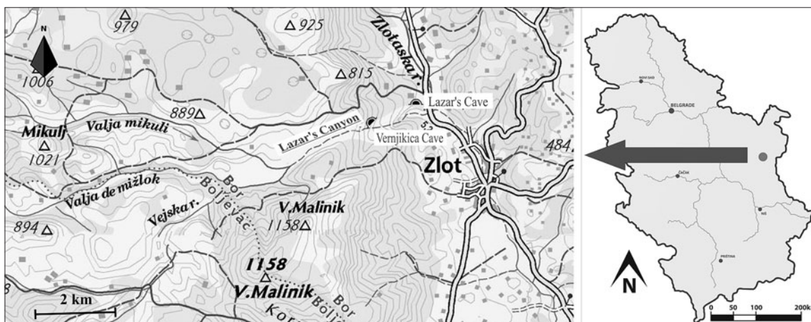
Figure 1. Location of study area