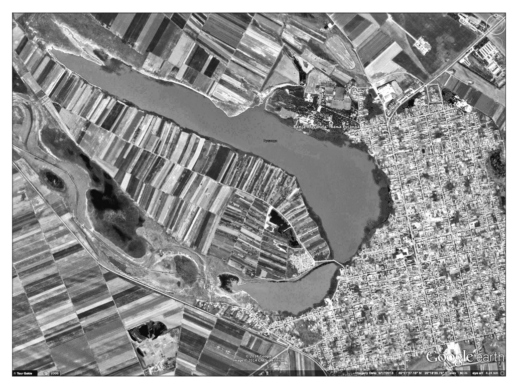
Map 1. Location of spa in relation to the lake Rusanda

A little later, in 1878, spa complex was opened on the north coast and it is a place where it remains today. Until today, Rusanda continually builds and develops its capacities and now it is a special hospital for physical medicine and rehabilitation and it is one of the leading and most important institutions of its kind in Serbia (Romelić, 2008). Map 1 present position of Rusanda in relation to the namesake lake.