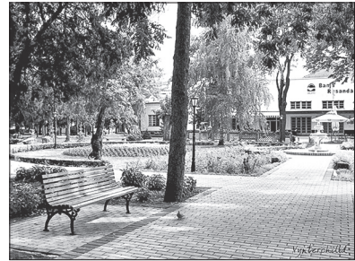
Figure 1 and 2. Rusanda

Vojvodina Province with a sufficient amount of moisture. The third significant wind is northern. It is cold and often very strong wind (www.zrenjanin.rs). Spring and early fall offer the best weather for staying in the spa, primarily because of pleasant temperatures. During the summer, staying in the spa is also friendly, primarily because of the park, which is located around the spa complex which is the reason why high temperatures are mitigated.