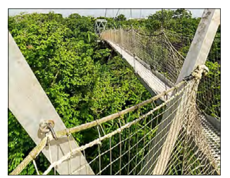
Figure 4. Canopy walk