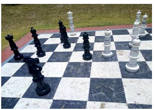
Figure 5. Floor Games