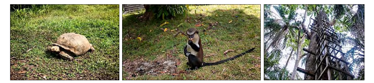
Figure 3. Available species and Tree house