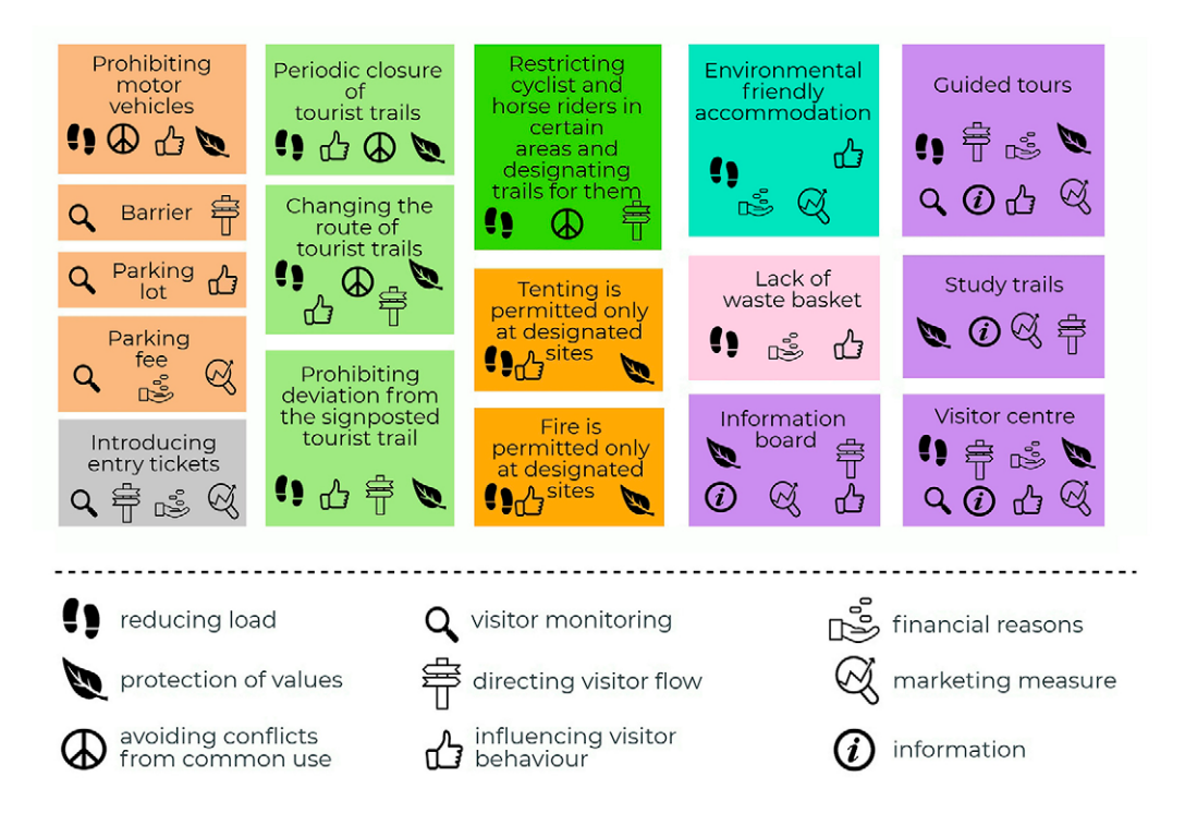
Figure 2. Potential advantages of visitor management measures used in the Börzsöny (own source, based on Benkhard, Martonné, 2018)

experience of ecotourism experts and rangers. The ones can be observed at the Börzsöny area is shown on Figure 2. We have collected and analysed the benefits together with the tourism experts of the area by deep interviews. Online and printed literatures introducing the Börzsöny area and the analysis of touristic brochures have also contributed to establish our database.