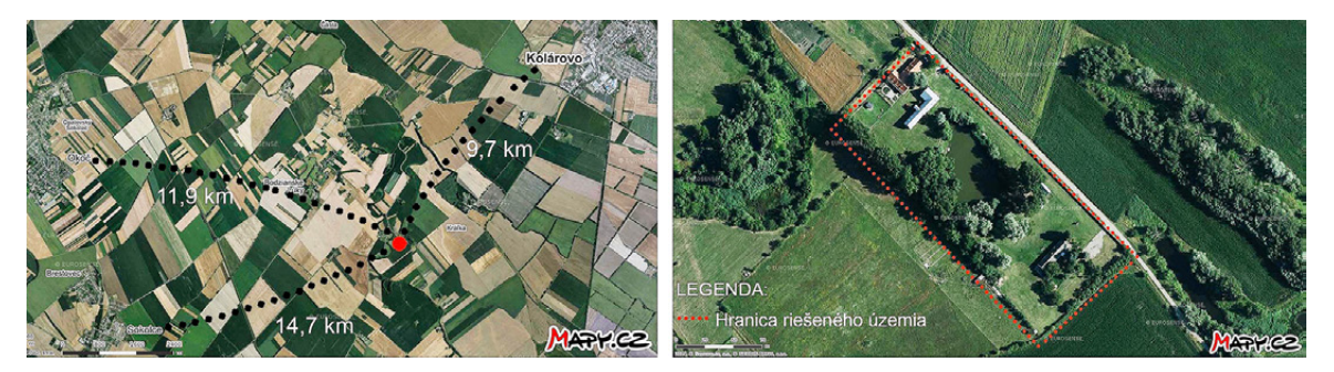
Figure 1. Location of the Environmental Educational Centre Dropie

tection Area Ostrovné lúky, and the NATURA 2000 site. The EEC offers educational activities for the schools and visitors.