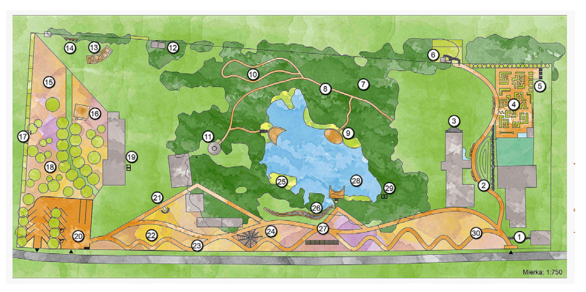
Figure 3. Landscape architectural proposal of the EEC Dropie