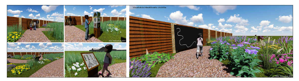
Figure 5. Visualisation of the interactive educational path

The landscape architectural proposal should lead to the improvement of the services of the EEC Dropie, which could help to increase the public demand for this place. EEC Dropie lays in the region where other recreational activities are available. For example: an international cycle road along Danube river, plenty of hot springs with spas (the closest is thermal spa in Veľký Meder). Unique technical monuments are the water mills on the Small Danube – Tomášikovo, Kolárovo). There is an Observatory in Hurbanovo. The biggest fortress from the 19th century is in Komárno. This localities could broaden the recreational and educational experience of the visitors.