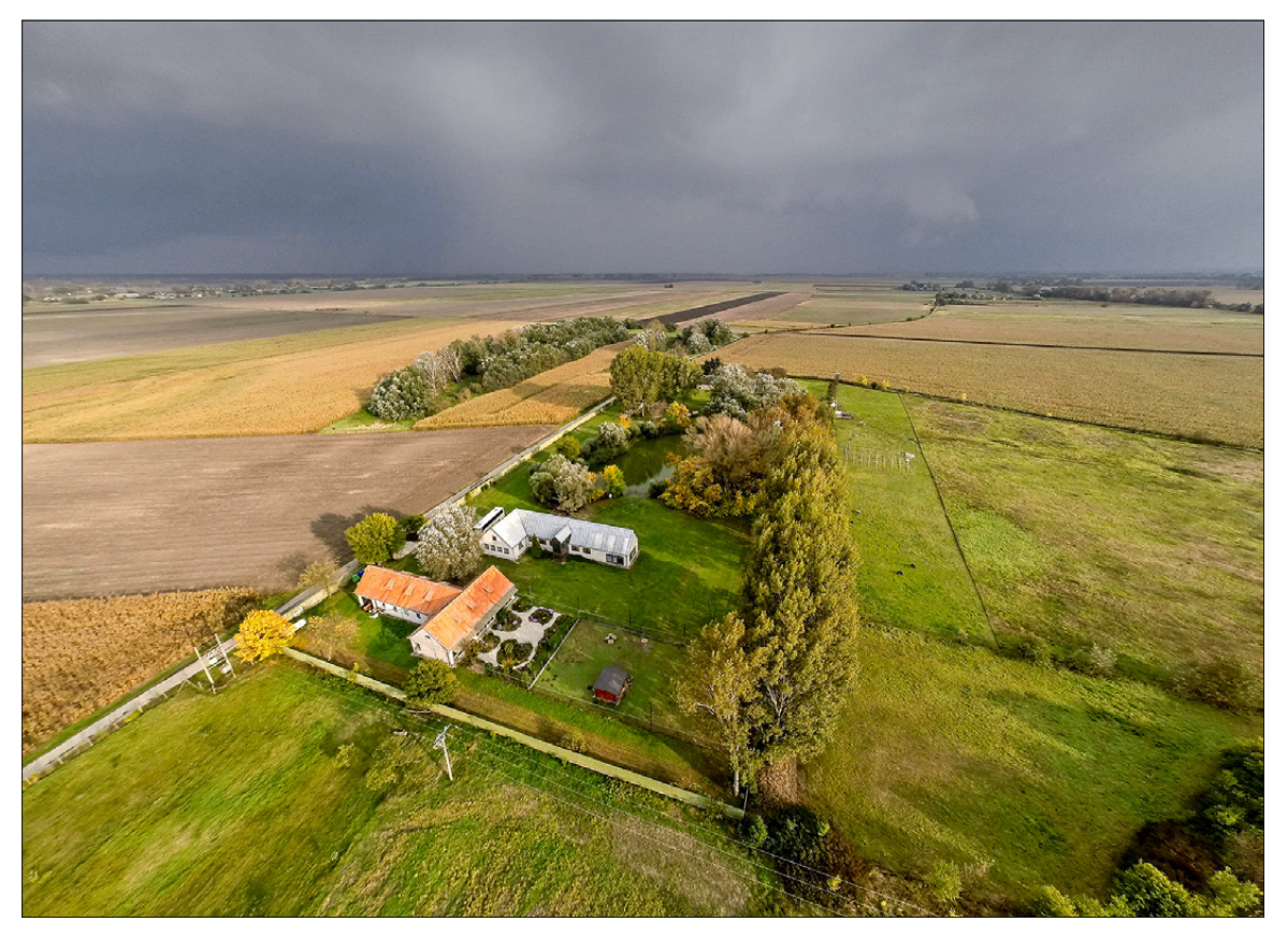
Figure 2. Areal view of the EEC Dropie

There is accommodation for 40 persons, outdoor places for camping, indoor and outdoor rooms for creative workshops and activities, interactive educational classroom, an herb garden and a small farm (Figure 2). There is also a fragment of luscious forest and pond in the EEC Dropie area.