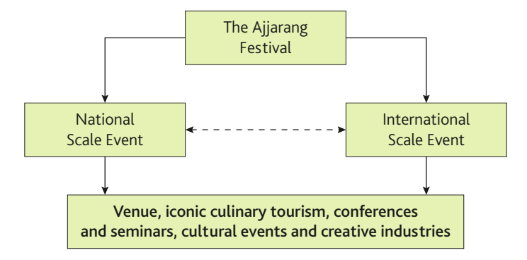
Figure 3. Bringing festival on national and international scale event

Making creative industries is one of the strategies in enhancing community participation in tourism. The local government seems to not include creative industries at the A'jarang festival. A cultural event should include a competition of creative industries that emphasise tra-