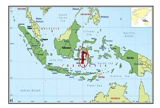
Figure 1. Map of Jeneponto regency of South Sulawesi province of Indonesia

Jeneponto regency is well recognised with its "horse" (kuda in Bahasa Indonesia and Jarang in the local language), a brand that brings Jeneponto as the center of horses (Wangsyah, 2016). Horse meat is mostly consumed by Jeneponto people. Thus, it is not surprising that coto kuda