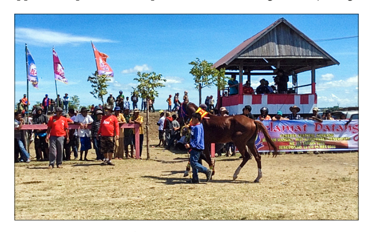
Figure 2. The A'jarang festival in Jeneponto regency

The government of Jeneponto realises that there should be efforts to change peoples' mind about Jeneponto. Karaeng (Mr.) Jalaluddin, the head of the local board of tourism and culture with his staff work to create events and activities to attract domestic and international tourists. Since the horse has become the icon of Jeneponto, A'jarang or Ajjarang festival (festival of horse or horse riding/racing) is the option for the local government to promote tourism potential. Three reasons for the establishment of the A'jarang festival include encouraging Jeneponto people's awareness and love for horses and horse farming; to inform local people that in addition to consuming horse, horse can become entertainment, an alternative form of income generation; to support and promote Jeneponto tourism through the A'jarang festival.