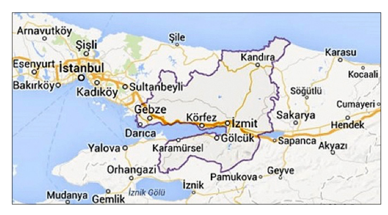
Figure 1. Map and location of Kandira Region

Kandira, with its 52 km-long coastal area, is located within the borders of Kocaeli city, surrounded by Sakarya ( Adapazari ) city on the east, Istanbul city on the west, Izmit (Kocaeli) city center on the south and the Black Sea on the west (Anonymous, 2015). The topography of Kandira is covered with small hills and in the shape of apparent land; it is subject to the effect of Blacksea climate. There are villages with high rural landscape values in Kandira. Some examples are Agacagil and Akcakese villages with their genuine houses and roads including inlaid stones dating back to Ottoman Empire; Akcaova, Akinci and Bagirganli Villages with their leadership in Kandira stone production; Cebeci village with its wide and shallow blue flag coasts; Kefken with its pink rocks in interesting geological forms; and Kerpe with its historical port (Uzumcu, et al., 2015).