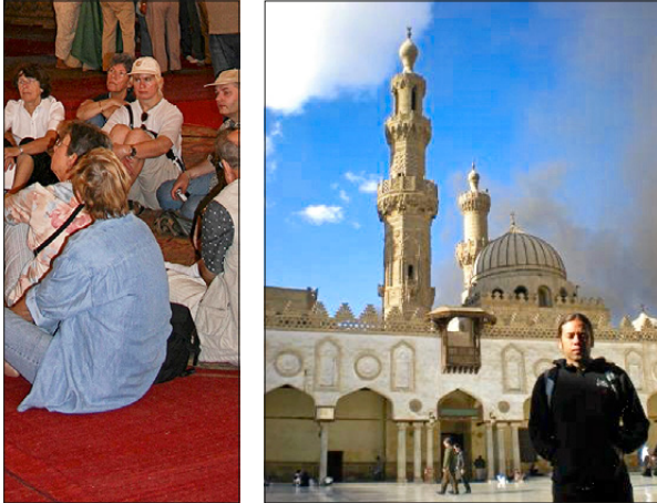
Figure 3. The image on the left shows tourists sitting on the floor, listening to the sheikh's explanations; the right image shows a tourist being photographed in front of or near the two elegant minarets with crescents at the top.