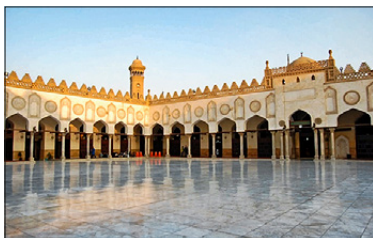
Figure 1. The large open air courtyard (sahn).

The authors would like to thank the sheikhs and visitors who freely gave of their time to share their views and experiences with us about the Al-Azhar Mosque.