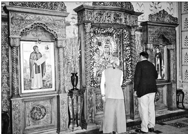
Figure 4. Worshippers in front of the icon of Holy Mother of God Trojeručica (three hands) in the Grgeteg monastery