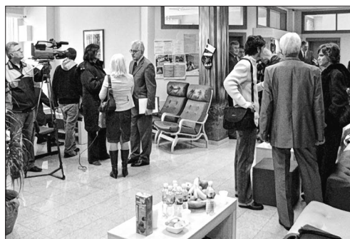
Figure 5. and 6. Scientific debate on sustainable faith tourism on Fruska gora held at the Faculty TIMS, Novi Sad, 2008