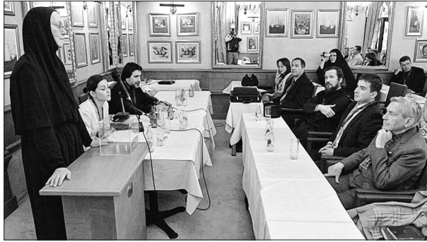
Figure 7. The first conference on faith tourism in the Balkan Hotel in Belgrade, 2006