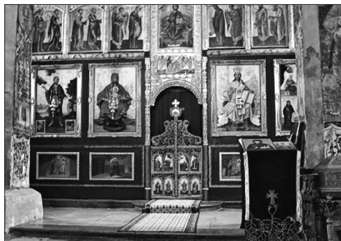
Figure 2. and 3. Iconostas' is of Krusedol monastery and its immediate surroundings