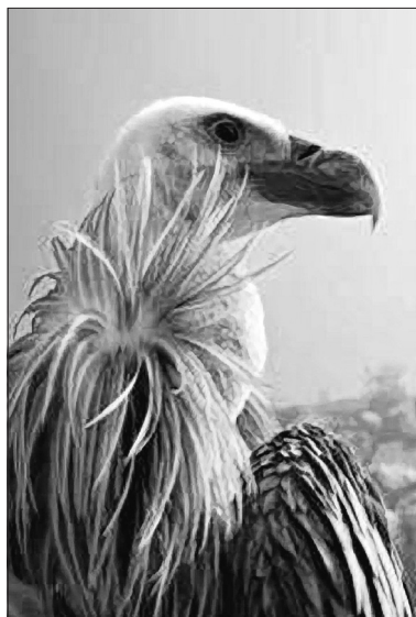
Figure 3. Griffon vulture; www.novavaros.com

Mountain Zlatar is situated between the Uvac river in the east, the Lim river in the west, the Bistrica river in the north and Milesevska river in the south. It stretches on the northwest-southeast direction and has the total length of 22 km. The highest peak is Golo brdo with altitude of 1,627 m and the rest of the mountain is between 1,000 and 1,200 m of altitude.