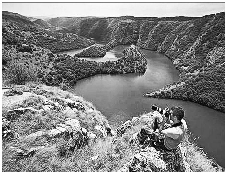
Figure 2. Valley of the Uvac river

Impressive canyon of the Uvac river was first officially protected in 1971 and declared as Special Nature Reserve "Uvac". Within the karst rocks of the cliffs in the canyon of the Uvac there are numerous relief forms among which there are mainly rock shelters, caves and pits. Among the caves the most prominent is the system of Uvac caves the second largest cave system in Serbia with the total length of 6,185 m. ( http://www.asak.org.yu/caves/srbdeeplong.php ).