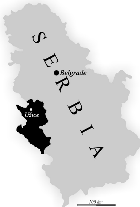
Map 1. Zlatibor County in Serbia

table to include the valley of the Drina river with regard to their parallel development and affirmation in tourism. Equivalent to this destination, another destination the valley of the Uvac river and mountain Zlatar, was selected. Zlatibor is the most frequently visited mountain and an independent destination and as such the subject of the research. Destination the valley of the Lim river covers only the area of Polimlje on the territory of Serbia and the mountains around the river. The destination Pester Plateau is the least developed from tourism aspect, but attractive and perspective destination for its natural resources.