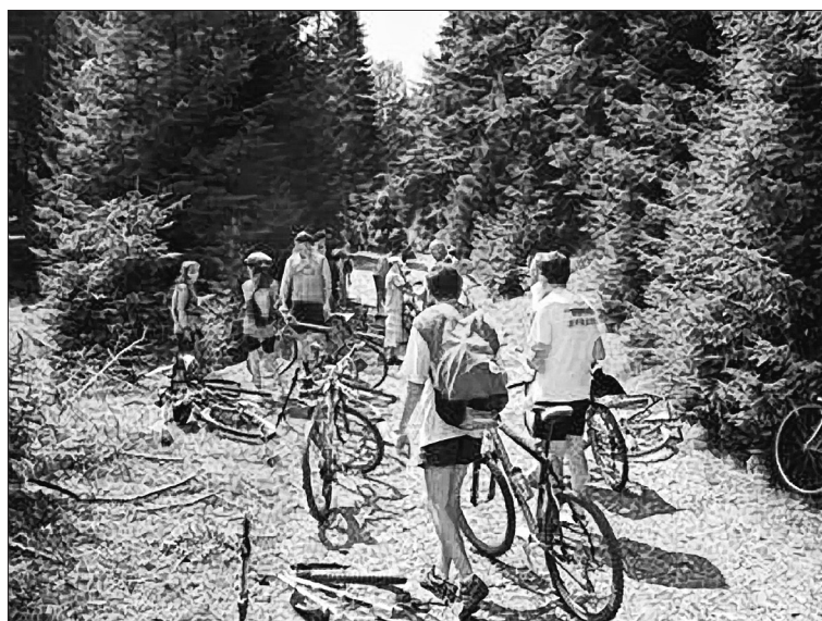
Figure 5. Cycling on the Zlatar; www.zlatibor.com

Pestersko polje is a protected Special Nature Reserve, covering the area of over 50 km 2 at 1,150 m of altitude and being the largest karst field in the Balkans (Amidzic et al, 2007).