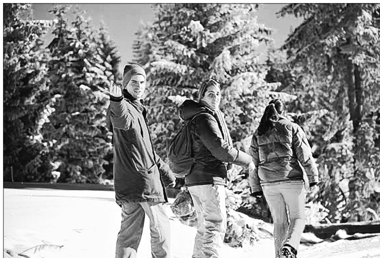
Figure 1. Hiking on the Kamena gora

table to include the valley of the Drina river with regard to their parallel development and affirmation in tourism. Equivalent to this destination, another destination the valley of the Uvac river and mountain Zlatar, was selected. Zlatibor is the most frequently visited mountain and an independent destination and as such the subject of the research. Destination the valley of the Lim river covers only the area of Polimlje on the territory of Serbia and the mountains around the river. The destination Pester Plateau is the least developed from tourism aspect, but attractive and perspective destination for its natural resources.