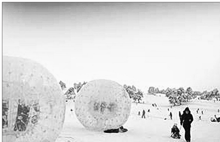
Figure 4. Zorbing on the Zlatibor; www.novavaros.com

Pester Plateau ( Pester ) is a karst area in Dinaric Alps with average altitude about 1,150 m (Markovic, 1980). Pester stretches at 20 km and is bordered by the sources of the rivers Lim, Ibar, Raska and Vapa. It is also surrounded by Giljeva mountain in the west, Pometenik in the north, Stari Kolasin in the east and sources of the rivers Ibar and Lim in the south.