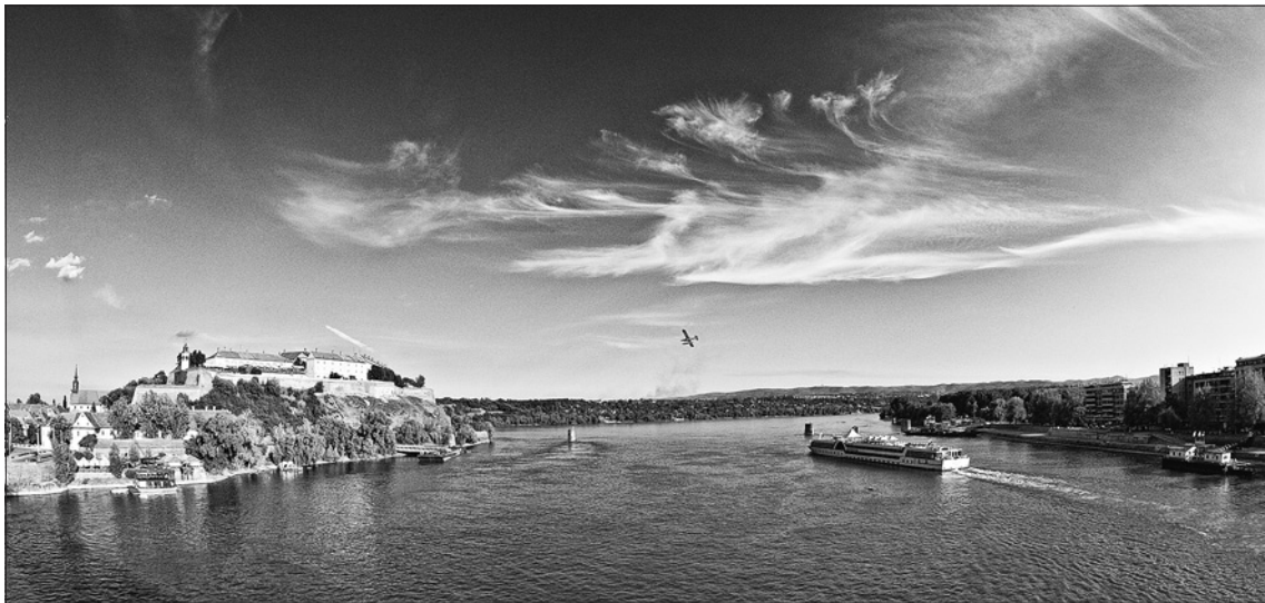
Photo 2 The Petrovaradin fortress on the Danube

tural and historical objects in fortification masonry. It features prominent architectural, artistic and ambience values with a special emphasis given to its cultural history.