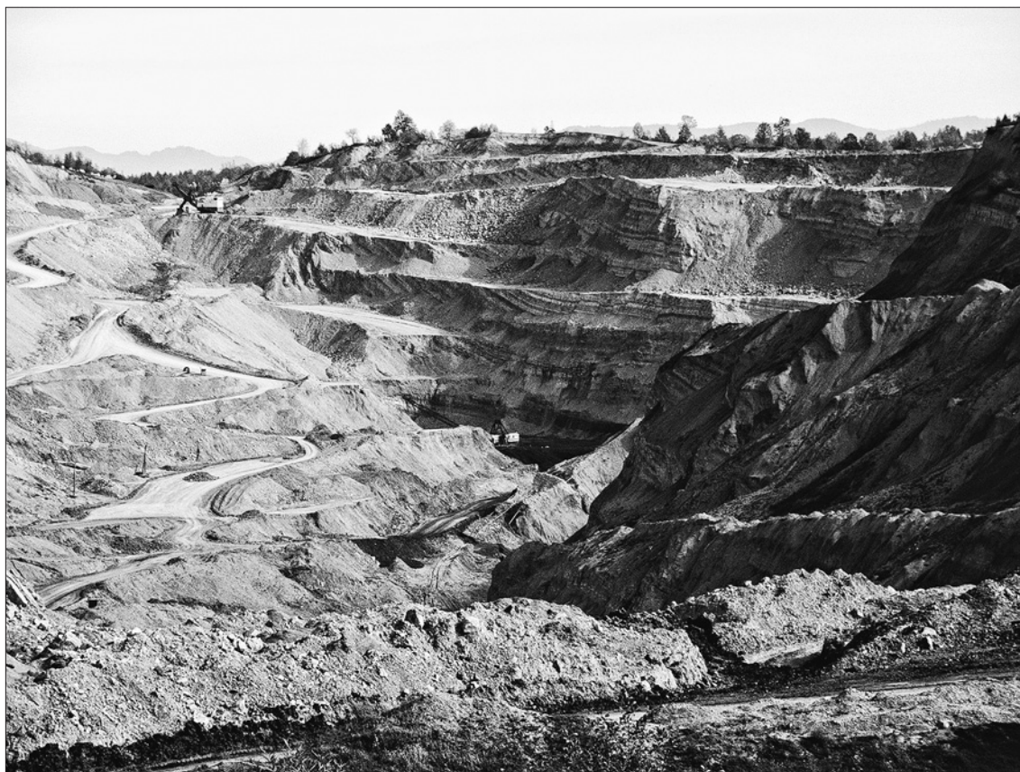
Figure 2 A detail representing the open pit Grivice (Banovići basin); Author: S. Smajić, October, 2006

Very frequently, the activation of the open pits required a complete or partial relocation of local water flows. Therefore, in the area of Šikulje, the flow of the river Spreča was relocated (5 km in length), the flow of Šikuljačka rijeka also (1.5 km in length) as well as the railroad (5.5 km in length) (Kulenović, 1991). There were some requirements for the coal exploitation at the open pit Lukavačka Rijeka: a tunnel was used to lead the water flow of Lukavčić into Smolučka rijeka, and a part of the flow of Lukavački potok has also been relocated. Its new water basin is situated further west compared to the previous one. In Višća the following items were relocated: the water flow of Oskova and a part of the railroad as well as the regional road (1.4 km in length), while