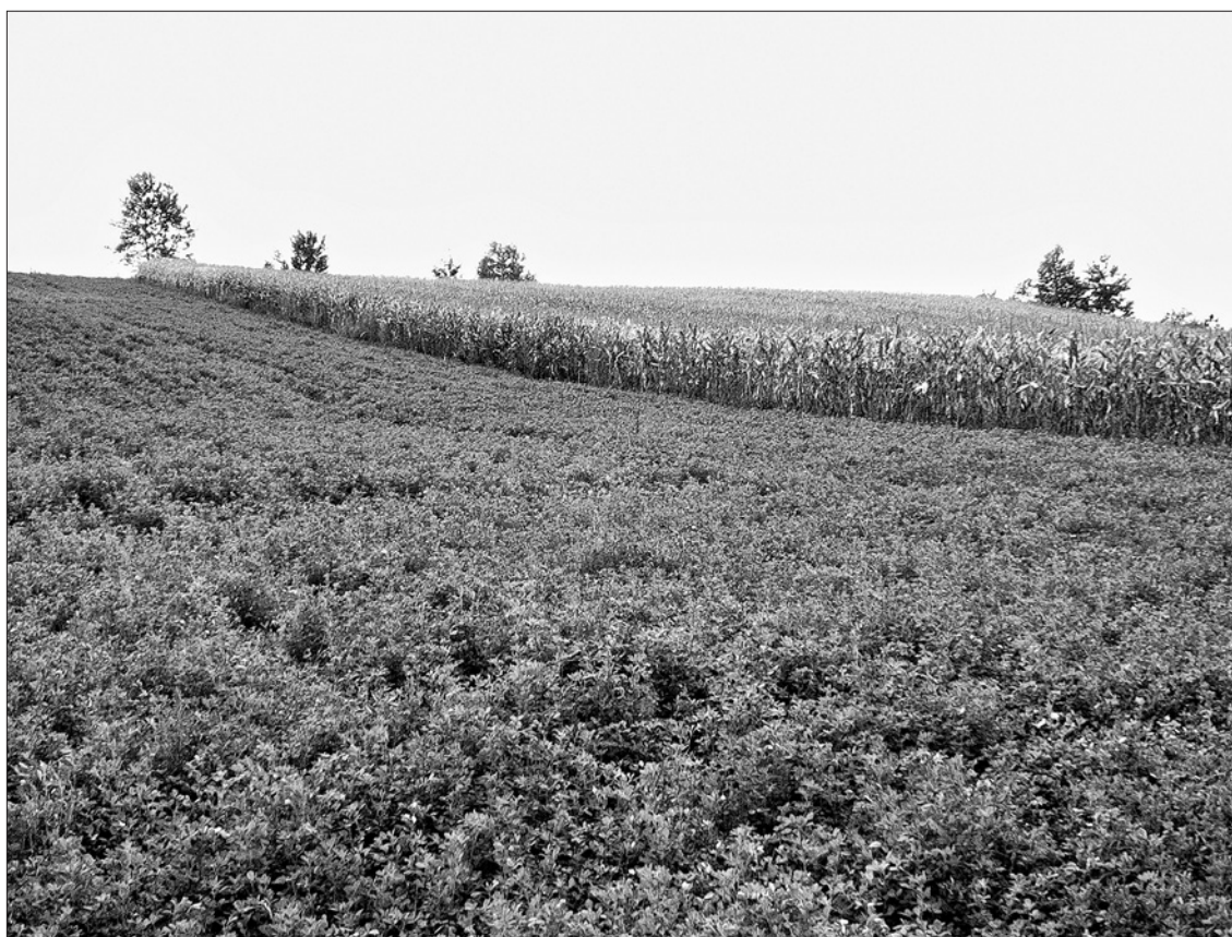
Figure 5 Agriculture production on the recultivated soil (Kreka basin); Author: S. Smajić, August, 2007

tral Europe, in the so called “The Black Triangle” region among the Czech Republic, Poland and Germany where ten power plants combust around 80 million tons of lignite and thus emit around 3 million tons of sulfur dioxide and around one million tons of nitrogen oxide (Manczyk, 1999). This means that this region participates with 30 % in the total emission of sulfur dioxide in Europe. Every day, about 20 thousand m 3 of waste water are released from the coalmines (screening) into the river Spreča. Coal dust and other suspended materials, caused by the erosion of open pits dump-sites, fill the bed of the river Spreča and its tributaries. That causes frequent floodings in their inundated areas.