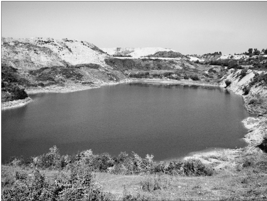
Figure 4 Anthropogenic Lake Ćenda (Đurđevik basin); Author: S. Smajić, September, 2007

the Rhine basin, which all give exquisite charm to the re-cultivated land. Some of the largest lakes cover the area up to 70 ha (Goedecke, 1978).