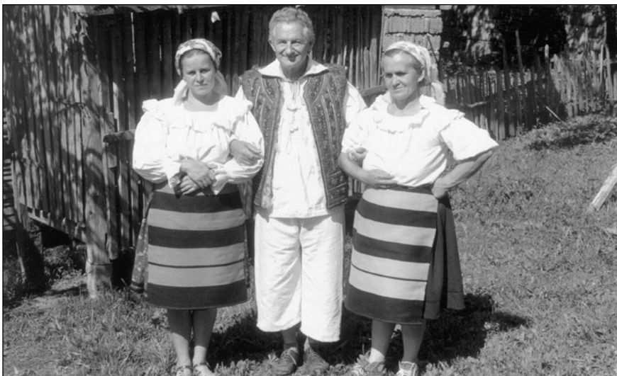
Fig. 3. Costume at Botiza: note the distinctive apron worn by the women.

Particular mention should be made of the wooden churches which demonstrate the quality of the wood carving tradition perpetuated today by the small