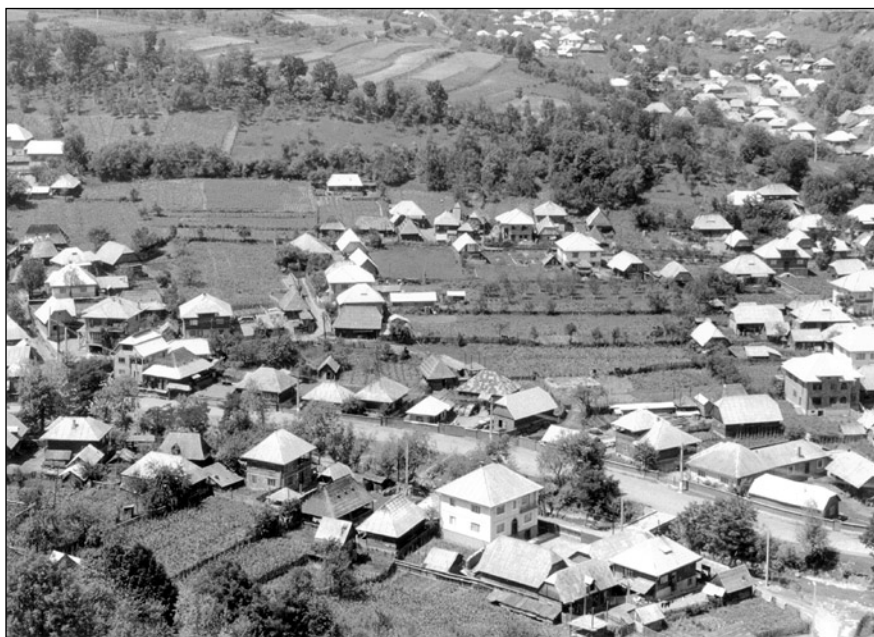
Fig.5. The village of Botiza with a number of two-storey houses (encouraged by communist 'sistematzare') among the traditional bungalows.

Reference should also be made to the cross-border dimension given the present government's priority for the cross-border cooperation and the existence of a Carpathian Euroregion which now includes Maramures as well as three other counties in the North West of Romania (Bihar, Salaj and Satu Mare). Since Romania's immediate neighbours (Hungary and Ukraine) are both enthusiastic members there are good prospects for enhanced accessibility, once the old attitudes associated with the closed frontier regime and the former Soviet threat have been overcome. There will be posi-