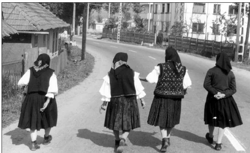
Fig. 4. Costume at Moisei: a group of women take an evening stroll

Although the wood processing is generally handled at large plants (Sighet Marmatiei and Viseu de Sus) there are smaller water-powered mills which survived the centralising pressures of the communist period. At Poienile de sub Munte the sawmill ('joager') was built in 1964 and, with favourable arrangements for getting wood from the forest, was able to provide sawn timber for cooperative farms lower down the Viseu valley. It was originally under cooperative ownership but has now been privatised. Corn mills were often closed down when factory-milled flour became available but others survived (Poienile de sub Munte and Sacel) as private operations with taxes paid in cash and in kind to the local authority. The number of mills has increased since 1989 because the capital required is modest and the power is cheap where families have the skill to build and install water wheels them-