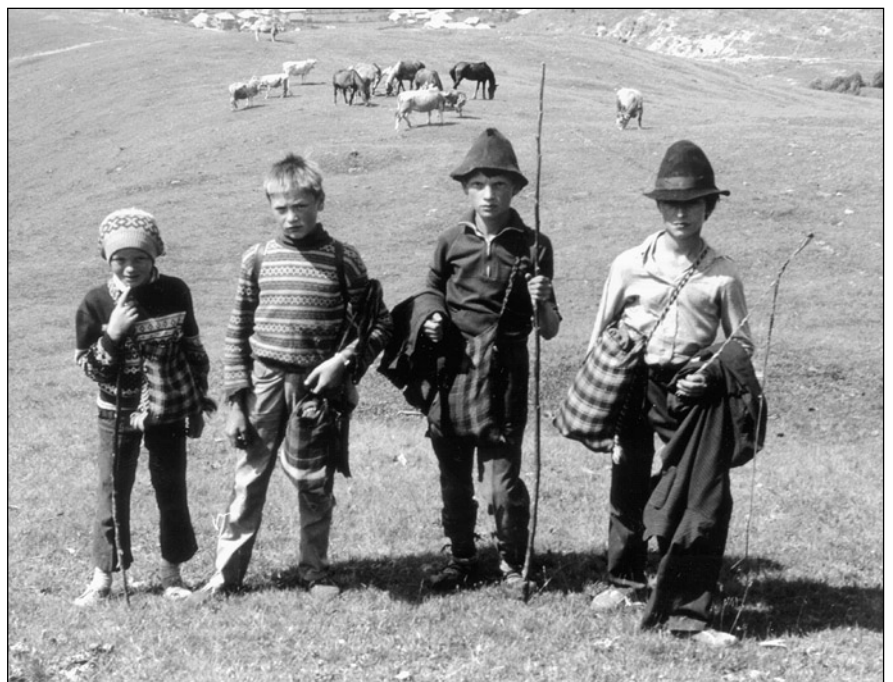
Fig. 1. The pastoral economy of Maramures: a group of boys watch the cattle on the Botiza common grazing

Under communism the area remained somewhat isolated since this northern border region had no major international transit function and the main line railway along the Tisa Valley (built by the Hungarians in the late nineteenth century), which looped into Romanian ter-