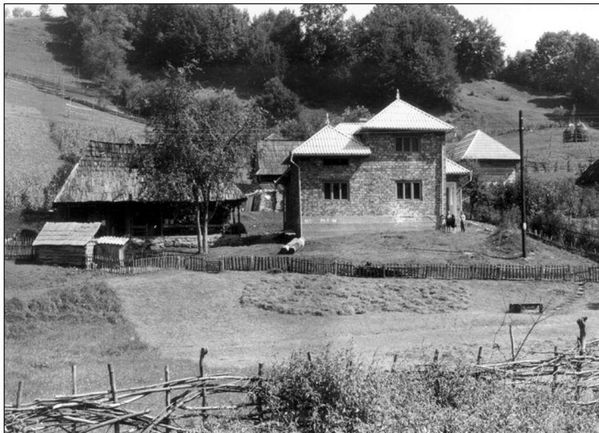
Fig.6. An isolated farm between Viseude Sus and Moisei; retaining its own building perimeter while making concessions to communist systematization through the partial construction of a second storey.

There is also a drawback arising through pollution associated with non-ferrous metallurgy. There is already a large complex at Baile Borsa and further expansion in the area in the future cannot be ruled out given the possibility of further mineral prospecting east of Borsa and the extension of the railway to mining complexes in the Burcoaia area has been suggested although the high cost of mining makes any large-scale development unlikely (Iacob 1995). Already environmental damage