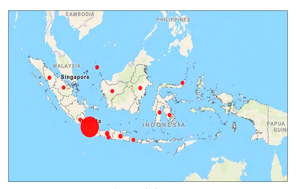
Figure 2. Blocking zone

though they live and are scattered on separate islands due to the sizeable area of Indonesia, this is not an excuse and instead becomes a geographical advantage that blocks the transmission route of the pandemic (Susanto et al., 2020). Here, the Indonesian government is not too bothered about limiting the mobility of the population. This position clearly benefits Indonesia. However, the vital problem is the level of density that accumulates in 2-3 areas, which are indeed the concentration of infection prevention. The predicate of Indonesia as one nation that failed to close access to the transmission of Covid-19 is an antithesis that hurts the field of epidemiology (Roziqin et al., 2021). Compared to neighboring areas such as Singapore in Southeast Asia, which have a minor population, they have made achievements because they make quick and responsive decisions. Therefore, Indonesia's superior climate and geographical composition have been wasted and have not hampered this virus. At the world level, performing the Indonesian government's policies is the 4th worst in solving the Covid-19 problem. Unfortunately, the government's