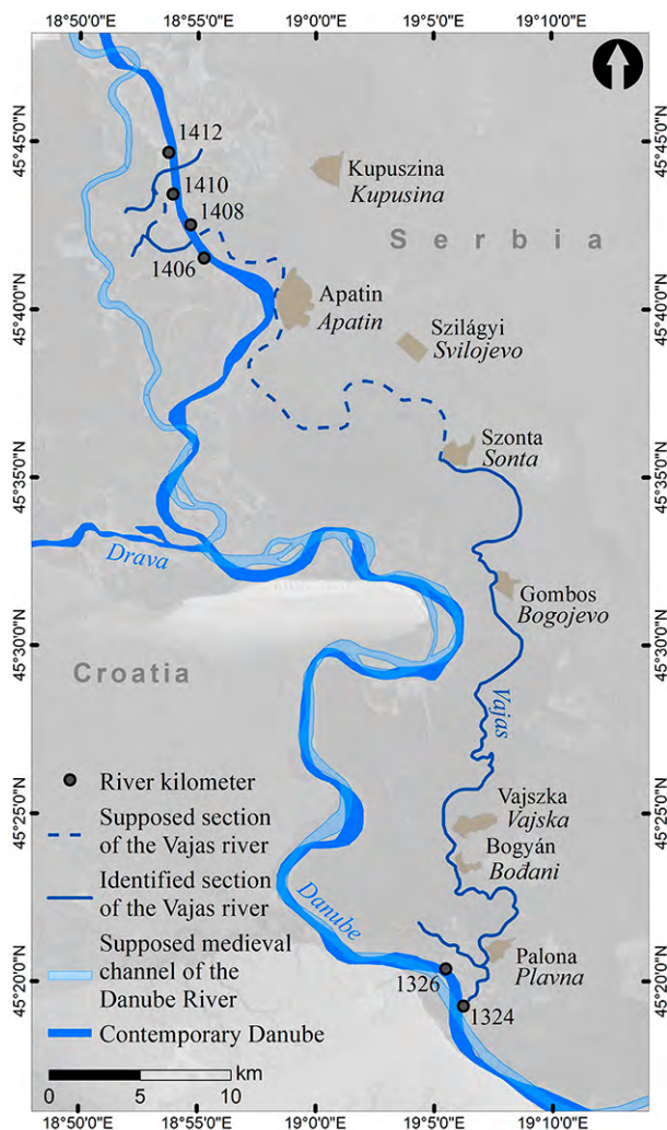
Figure 5. The reconstructed channel of the Vajas 4