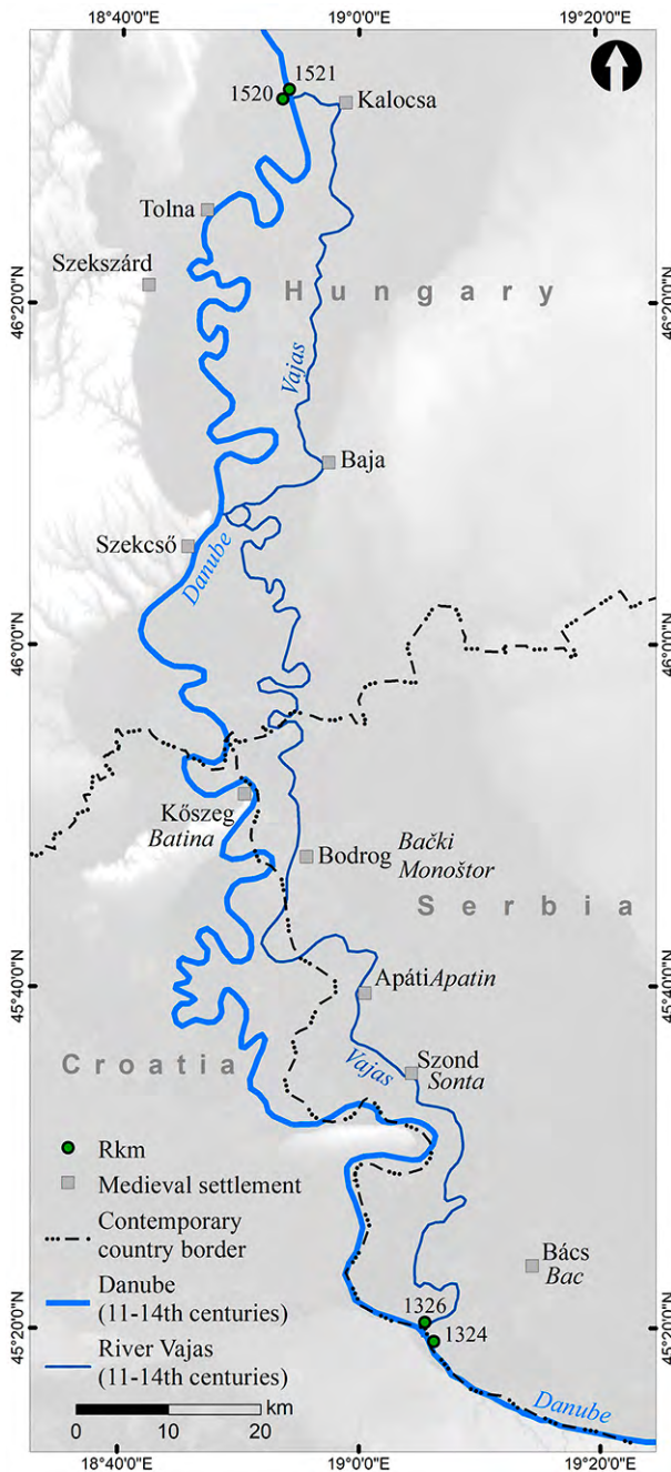
Figure 1. The River Vajás on György Györffy's map

fortunately, the maps of the survey are incomplete, as a significant part of the sheets was lost or destroyed in the last century. Fortunately, the missing sections can be replaced based on maps made from the originals, representing larger areas (MNL PML Pmt018; HM HIM BIXb 122/2; BIXb 134). The descriptions made for the sections of the Danube Survey also contain a very large amount of data, which is of particular interest from a water and regulatory point of view (DM; see the descriptions in MNL OL S81 Vízrajzi Intézet, iratok 1/b.).