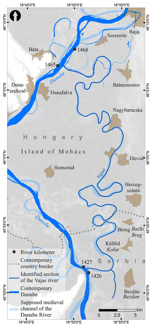
Figure 4. The channel of the Vajás 3

(Brodarics, 1983; Andrásfalvy, 1975; Gosztonyi, 1891). The river was sailed, boat mills, and from the beginning of the 16 th century a cloth mill was also operated on the Vajás (1348: Nagy et al., 1872, 298., 319., 377., DL 76901; 1391: Nagy et al., 1872 471.; 1405: Nagy, 1888 389., DL 82376, DL 82377).