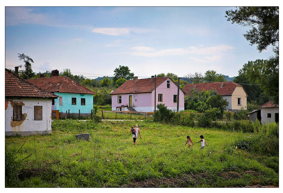
Figure 2. Szakácsi in Borsod-Abaúj-Zemplén County.

tlement and dead-end village but the homes are wellkept. The image of the village is friendly many houses were renovated and function as guest houses in the frame of the project 'Fairy tale village' (Figure 3).