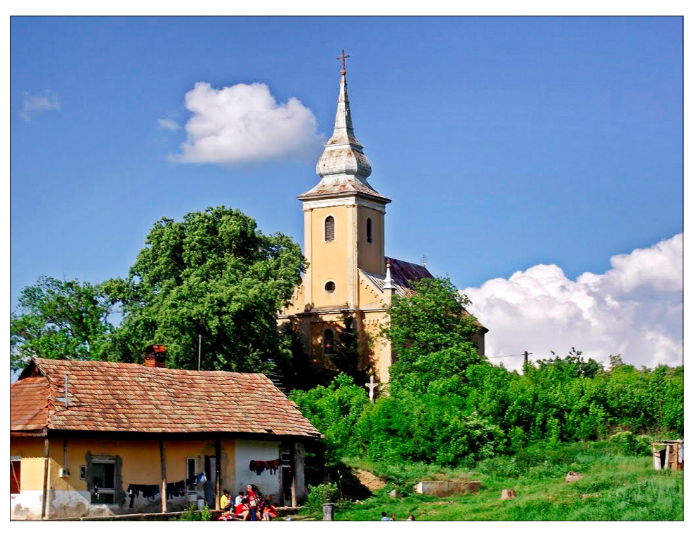
Figure 4. Abaújszolnok in Borsod-Abaúj-Zemplén County.

There is some coherence between the situation and development of transport of the settlements but the spatial mosaic is much more complex because settlements being in very favourable position are in the periphery as unfavourable in the vicinity of cities. The situation of transport was represented by distance of the nearest cities (Table 3). It was appropriate to separate the cities by legally and functionally on the base of the known characteristics of the cities. There are some of small cities in the areas of tiny villages that do not or slightly have functions of a city. Such cities are, among others Cigánd, Pálháza, Gönc, Szob, Beled, Jánosháza, Zalalövő, Nagybajom, Gyönk, Sásd, Sellye or Villány although this is not an exhaustive list.