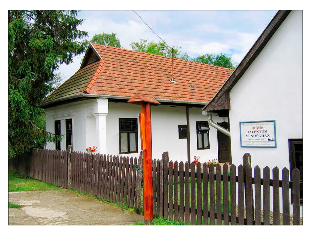
Figure 3. Guest house in Irota, Borsod-Abaúj-Zemplén County.

It was revealed by dividing the settlements into 50-people categories that significant substantive differences cannot be detected in case of segregation and the category below 200 people is not differentiating further by size. Group of villages with less than 50 inhabitants shows higher value based on the comfort of homes and proportion of people getting social assistance for longer than 180 days and this difference is not significant either.