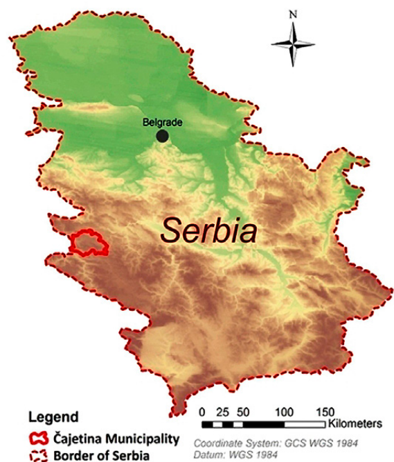
Figure 2. The location of Čajetina municipality in Serbia

Since the end of 19th century there was almost constant tourism development on the mountain. However, in the last 20 years there is a negative trend of tourist exploitation that strives to gain quick profit by extensively exploiting natural and anthropogenic values (Jovičić, et al., 2013). In Čajetina Municipality during investigated period of this study (2000-2006) the average number