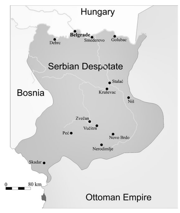
Figure 1. Serbian Despotate in the first half of the 15<sup>th</sup> century

After the Romans had left Great Britain in 410, the formation of towns came to a standstill which lasted until the 9<sup>th</sup> century when the Saxons, under threat from the Vikings, started building the first fortified towns. They built fortified market towns on the ruins of Roman towns as well as new towns including: Hereford, Oxford, Shrewsbury and Wilton. The Vikings also built their own towns on the location of former Roman towns including Leicester, Lin-