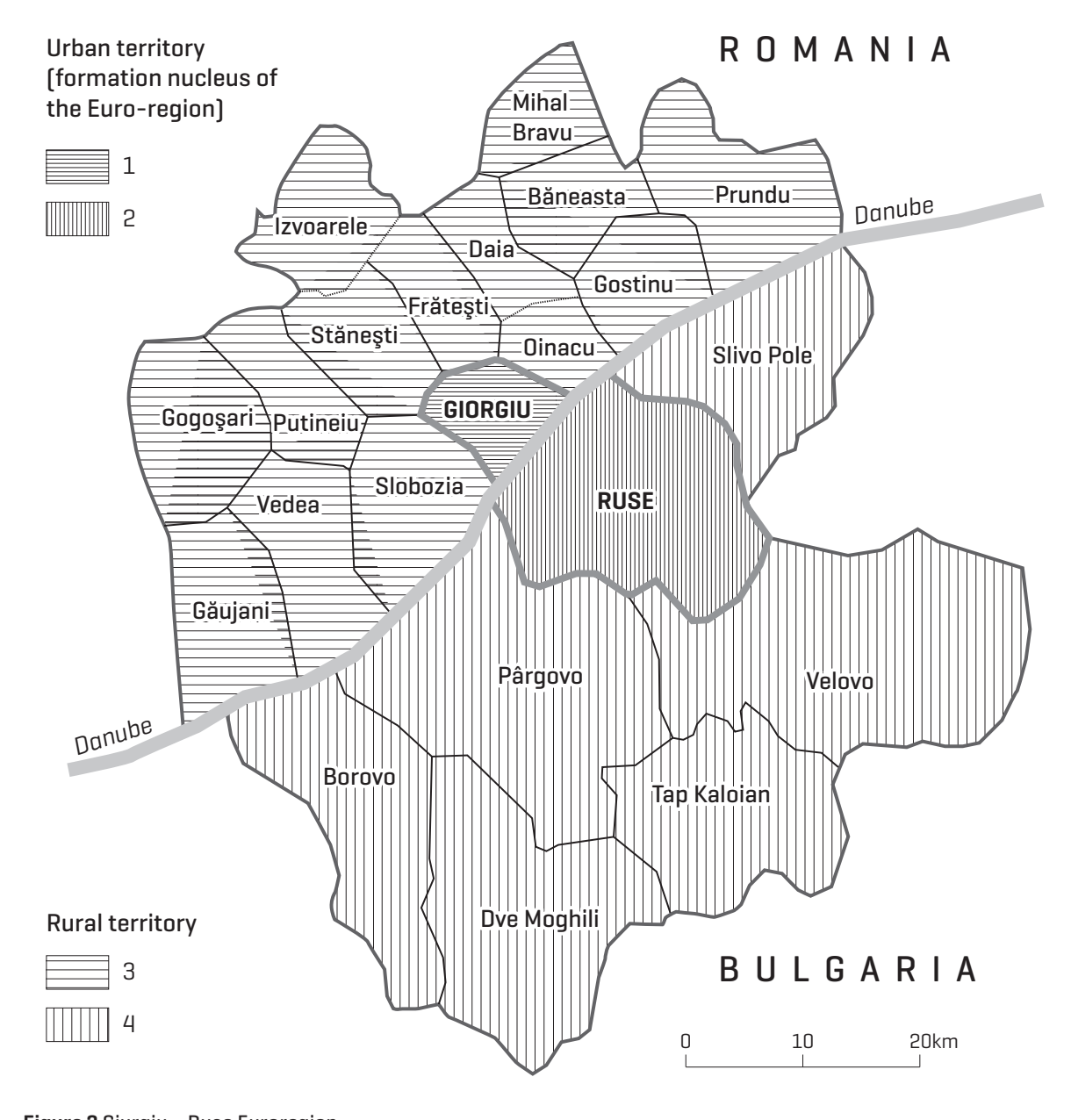
Figure 3 Giurgiu - Ruse Euroregion. 1. Urban administrative territory in Romania (Giurgiu), 2. Urban administrative territory in Bulgaria (Ruse), 3. Rural administrative territory in Romania, 4. Rural administrative territory in Bulgaria.

Its delimitation was made considering the urban polarization area, unifying the administrative-territorial communes units that gravitate towards the two towns, based on the distances on land thoroughfare. In the whole, there were elected 20 communes, 14 from Romania and 6 from Bulgaria; the discrepancy is the result of the dif-