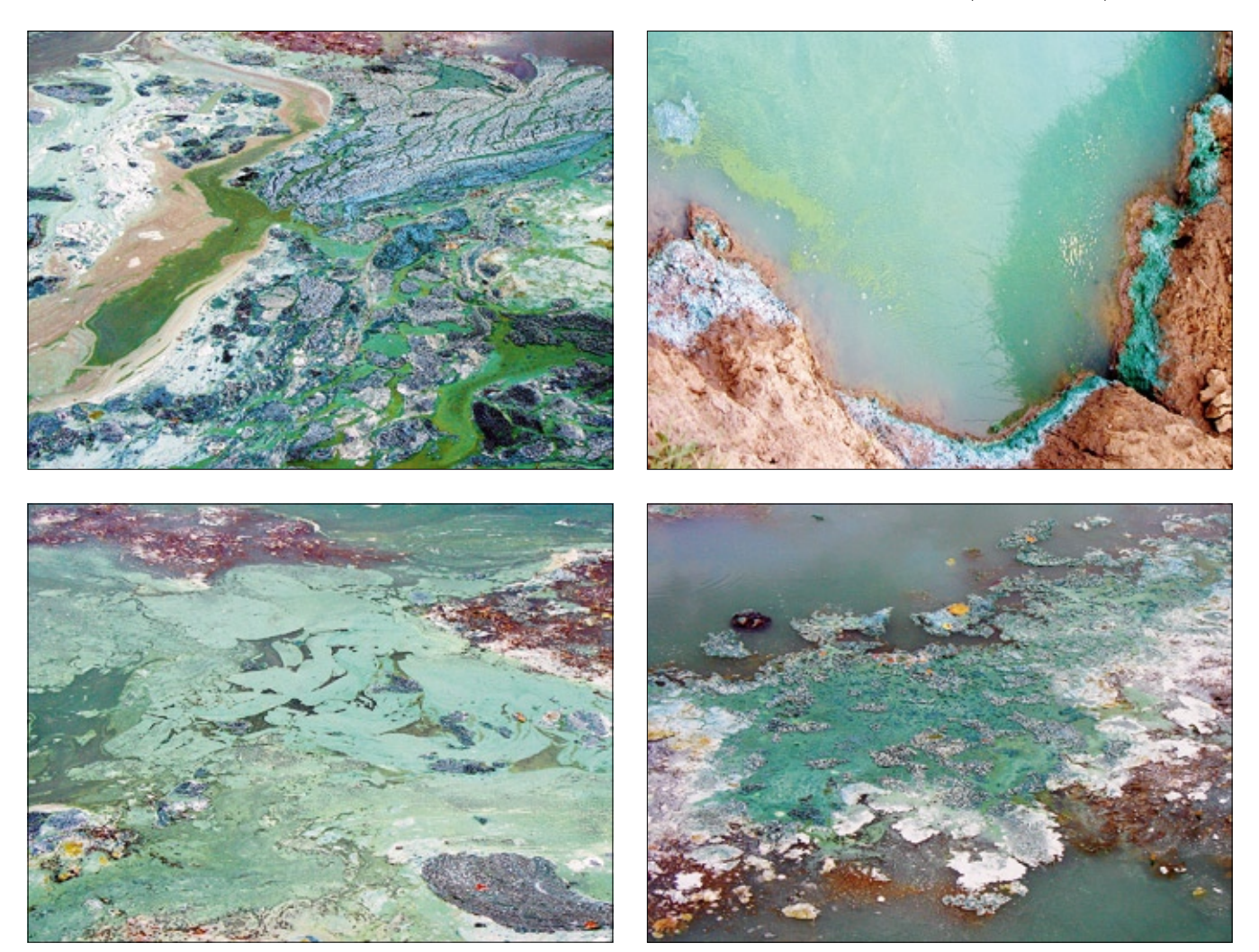
Plate 1 Cyanobacterial "blooming" in Celije reservoir in July 2004

concentrations mesaured were approximately 10 µgL<sup>-1</sup> MC-LR equivalents. Microcystin were detected in 40% of row water samples but usually the concentrations were less than 1 \mu gL<sup>-1</sup> (Lahti et al., 2001). The results of concentration of microcystin in Portugal indicate that during the most of the sampling period (1999) cyanotoxin values were below 50 ngL<sup>-1</sup> and the highest concentration was 173 ngL<sup>-1</sup> (Caetano et al., 2001). The highest recorded and reported microcistyn concentrations in samples with or without detected "blooms" are: 25.000 \mu g L^{\text{-1}} and 3.300 \mu g L^{\text{-1}} for anatoxina(S) in Germany (Chorus et al., 1998); in Japan for 1996 reported microcystin concentrations is 1.300 \mu gL<sup>-1</sup> (Ueno et al., 1996), while in 1997 as high as 15.600 and 19.500 μgL<sup>-1</sup> (Nagata et al., 1997).