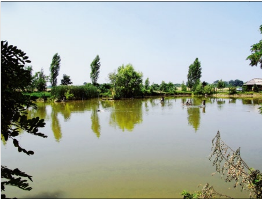
Picture 2 Fish pond of Nature Conservation Movement – Sremska Mitrovica

the embankment along the Sava river bed started. The building of the embankment lasted for over ten years and it was finally completed in 1986. Basically, the embankment was covered in concrete plates and reinforced by crushed rocks in the river bed. The part of the embankment outside the town remained without concrete plates. The building of the embankment demanded huge amounts of ground. At several localities along the Sava river in the wider area of the alluvial plain severe digging was performed for the construction purposes. One of the companies involved in building was Hidrograđevinar from Sremska Mitrovica, which performed digging works at several localities. One of those localities was the present Fish pond of Nature Conservation Movement.