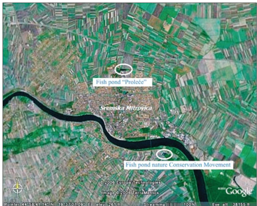
Appendix 1 Satellite picture of geographical position of Fish pond "Proleće" and Fish pond of nature Conservation Movement

Fish pond "Proleće" stretches on the west-east axis. The small pond is situated west of the large pond and its is a square in shape. The larger pond is in the east and its shape is elongated, wider in its western part, whereas its width decreases in its eastern part. The sides of the pond's basin are vertical, the shore being higher than the middle level of the pond for 80