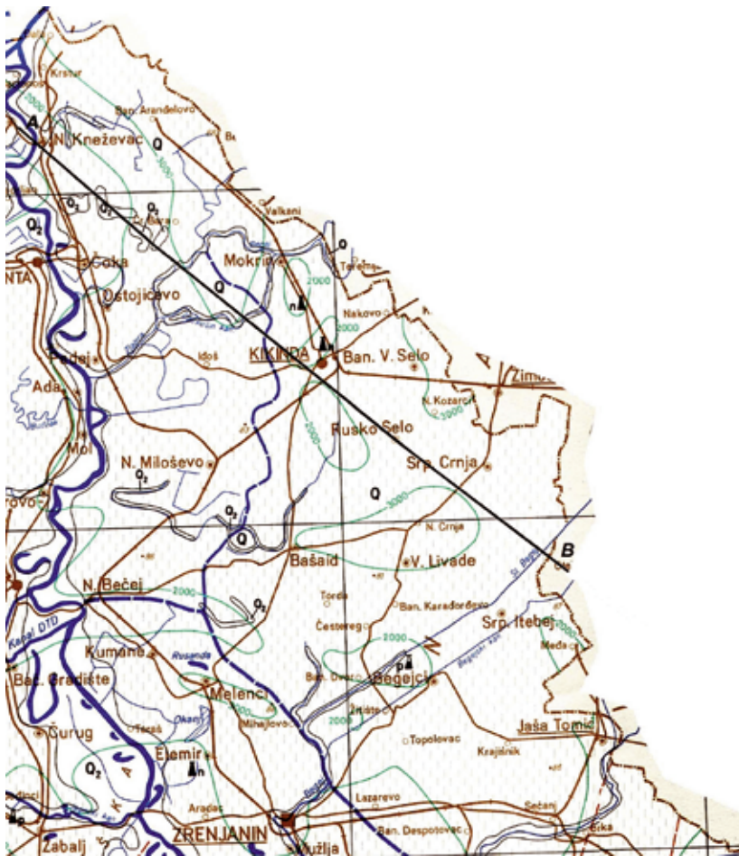
Fig. 2 Geological map of North Banat with indicated investigated section A-B

information for 32 water quality parameters selected to represent best the problem.