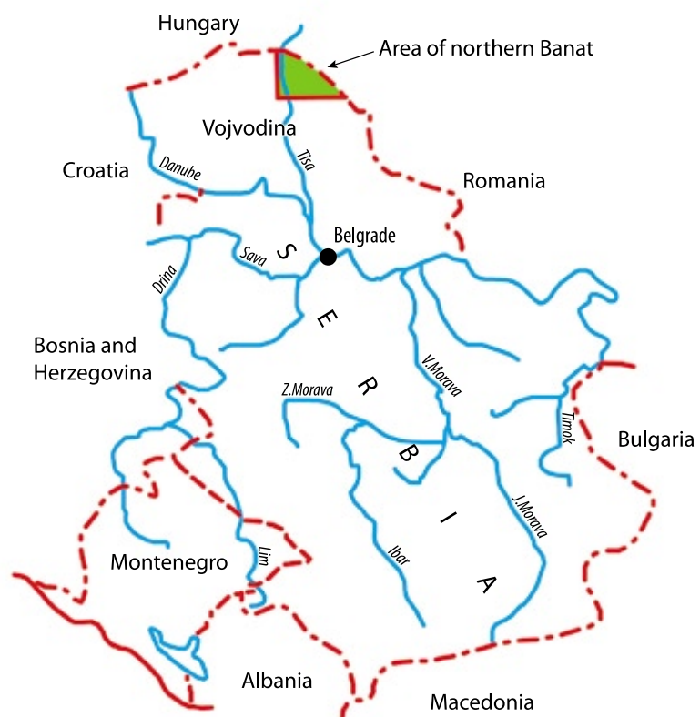
Fig. 1 Geographical location of North Banat

Interpretation of the given hydrogeological section is based on the available published information and exploratory drilling records for northern Banat (Fig. 2). Water was sampled from pressure pipes of the municipal water supply wells in each season of the year. The analysis covered series of 34-56