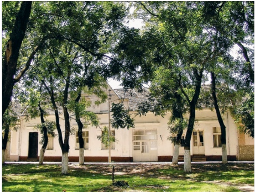
Figure 4 Park in the centre of village