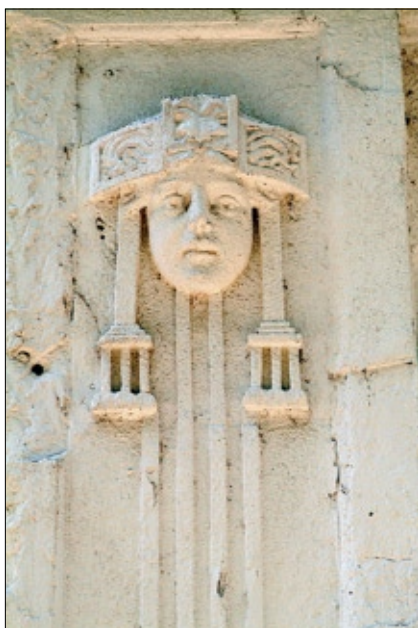
Figure 8 Secession detail on one of the facades

Culture centre has a library, restaurant and bar. Yard area is very spacious and is used as an open air stage for the needs of the mentioned festival. Culture centre does not require large investment in its re-