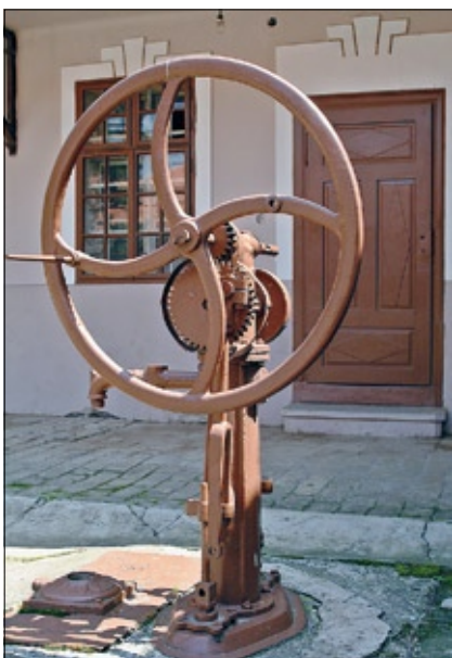
Figure 11 Old well in wine-house

One of the important and inevitable activities in village is organization and maintenance of the whole area, village and surrounding region.