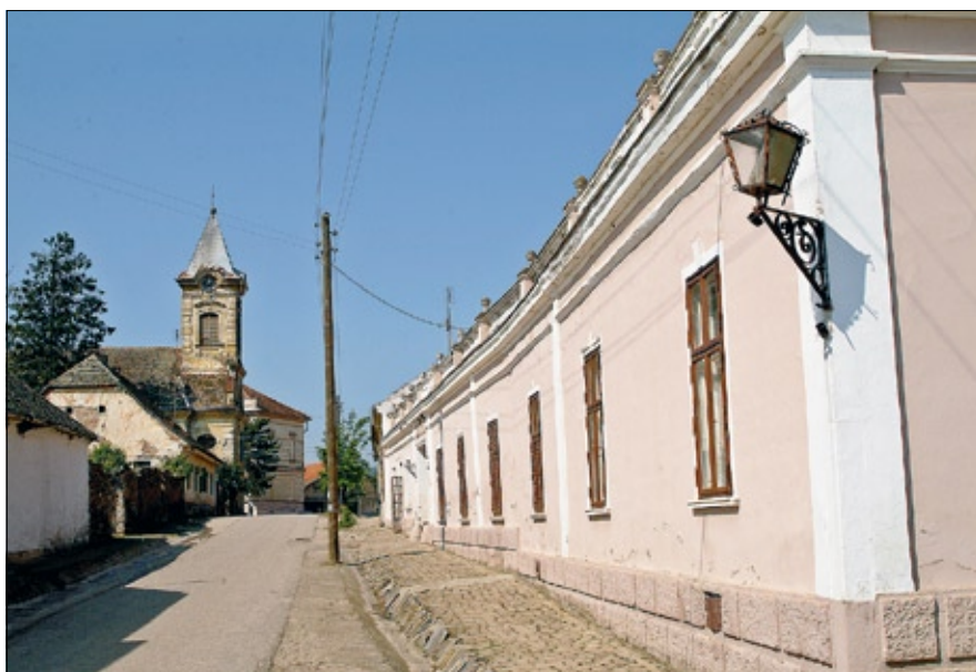
Figure 9 Centre of village with Catholic church

future, with economical and appropriate building of both residential and accompanying buildings and village canals. Certain parts of those objects (entrance gates, floors, supporting beams, certain stairs, yard parts, barns, tables, chairs etc.) were previously made of wood (there are plenty of it on Vrsacke mountains), and that tradition should also be preserved.