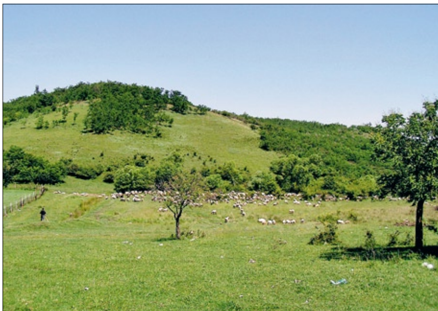
Figure 3 Cattle-breeding as part of rural tourism offer

Observed morphologically, the basic plan of the settlement Gudurica is of irregular shape. The village stretches along the left side of the Markovacki brook valley. The main street follows the edge of the valley side, and the village broadens towards south near the abrasive area. The map of the streets is also irregular, net type, which is