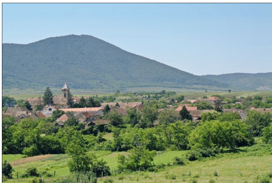
Figure 2 Panorama of Gudurica, beneath Gudurički vrh

and represent the area of intensive tourist gathering. Such destination, an undisturbed region of nature, receives visitors who get pleasure from the nature and respect the nature and cultural objects of the present and past. It also promotes preservation of the nature by receiving little influence of visitors and thus provides useful and active social and economic engagement. Prospective tourists, who come mainly from urban regions, define the rural character of the destination primarily according to the level of traditional social structures as well as general social values which are not present in urban centres. First of all, rural areas are supported by strong feeling of coexistence, local instead of cosmopolitan way of life, which is “slower”, less materialistic and less complicated in comparison to urban areas. Modern tourists’ growing interest in cultural heritage emphasizes the relevance of the features of the rural areas.