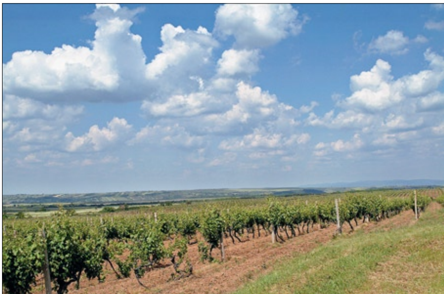
Figure 5 Vineyards around Gudurica

Gudurica was the most important vineyard centre in the villages of the Vrsacke Mountains, by the WWII and even later.