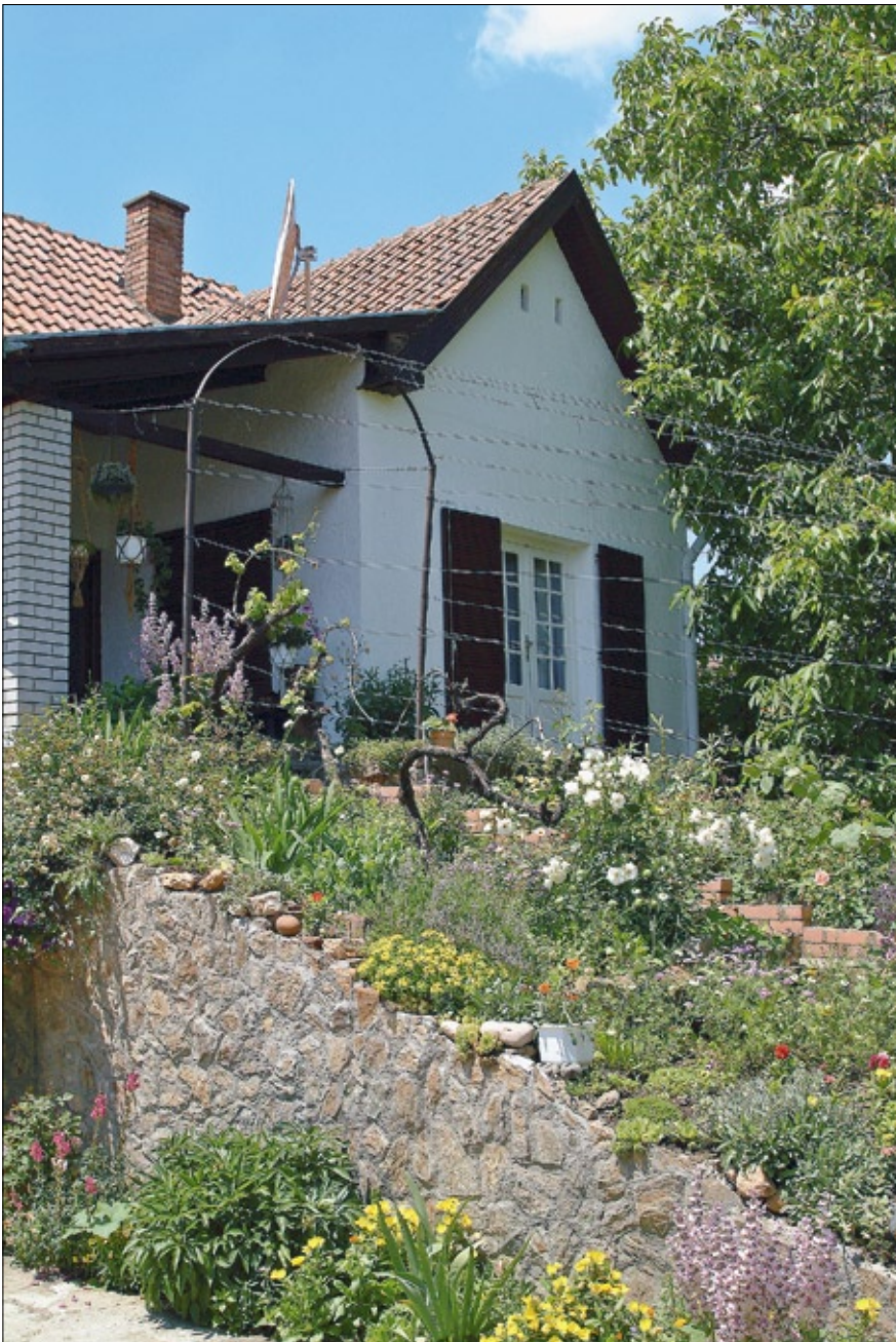
Figure 7 Potential accommodation offer

ries in Vrsac, which own certain portion of the land and vineyards in the area of Gudurica. The population, mainly the colonists from passive regions, is unaccustomed to long and heavy agricultural work. It is a fact that they never had a feeling that separation of soil working represents the most certain way of economic and social destruction. Our presumption is that they would more easily decide upon rendering tourism services, due to the fact that the agriculture is not the absolute and single way of earning money.