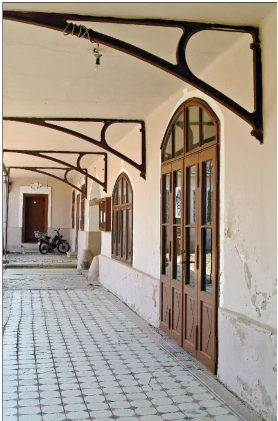
Figure 10 Traditional architecture

One of important preconditions for successful planning and management of