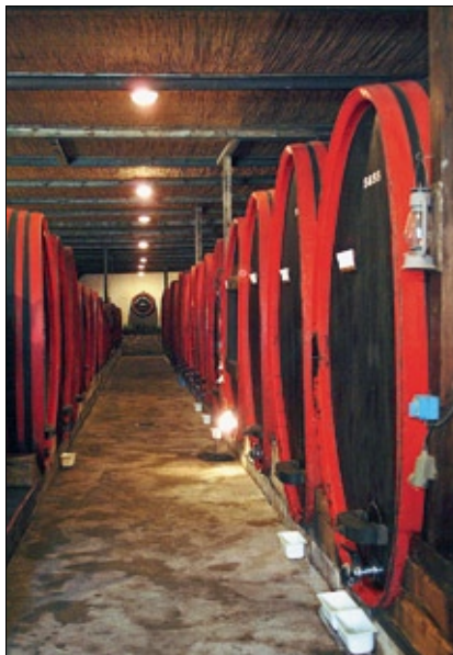
Figure 6 Wine-cellar

There are numerous historical data on that period. The data may serve as material, factual base for the homeland museum. The plans for the museum have been made and the location has been agreed upon. The opening of the museum would be purposeful, due to the fact that there are several human activities with interesting material (viticulture and wine production, history, ethnology, ethno demographic characteristics of the village through history and its problems).