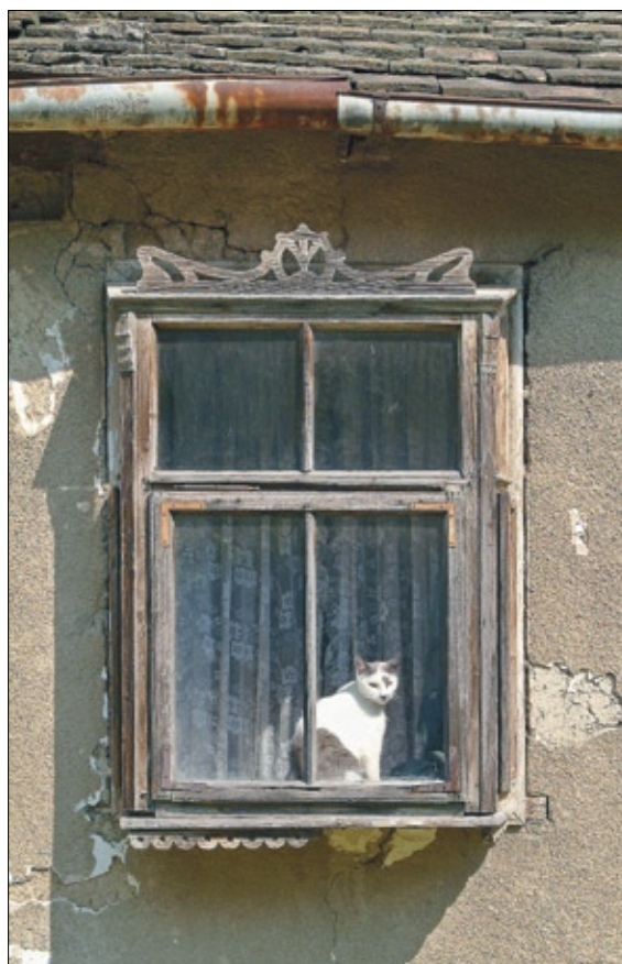
Figure 12 Traditional window („kibicfenster“)